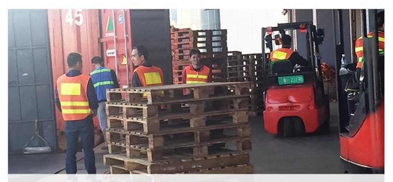
Own professional shipping company( Shenzhen Sunny Worldwide logistics)