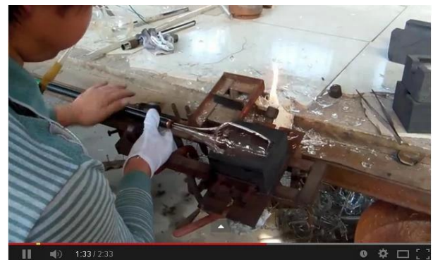
Hand Blown Technology