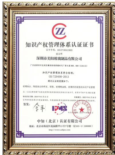
Enterprise Intellectual Property Patent No.:201630655323.4