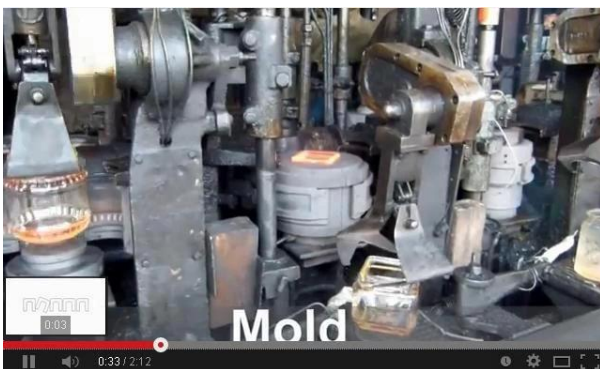
IS Machine Technology