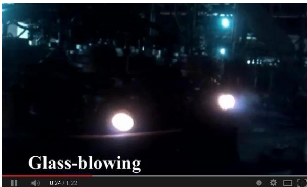
Machine Blown Technology

Hereby watch our production lines video online, and welcome to visit us onsite.