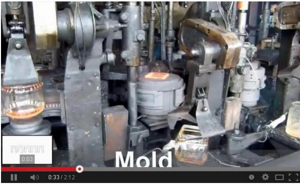
IS machine technology