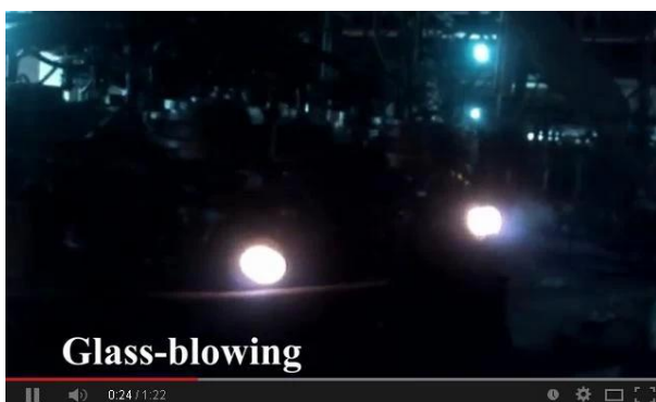
Machine blowing technology

Hereby watch our production line video online, welcome to visit us on site.