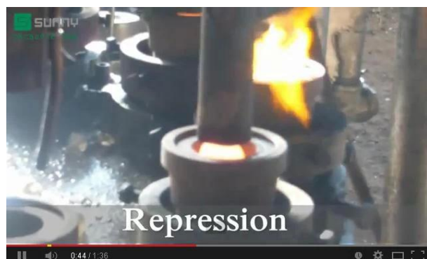
Mechanical press technology