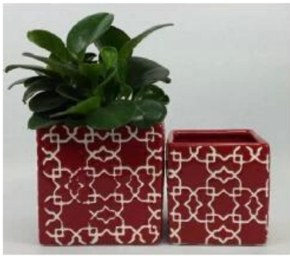
Red S16030-127 12.5×12.5×12.0cm S16030-102 10.0×10.0×10.0cm