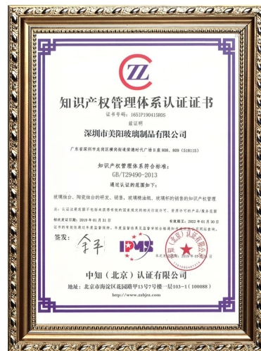
Enterprise Intellectual Eigendom Octrooi&Nr.:20163065523.4