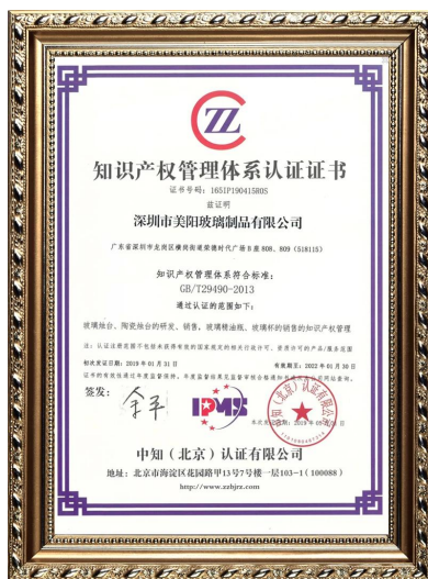
Mga intelektwal na pag-aari ng kumpanya