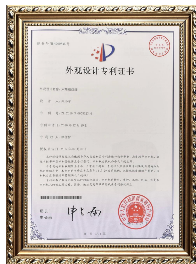
Numero ng patent: 201630655323.4