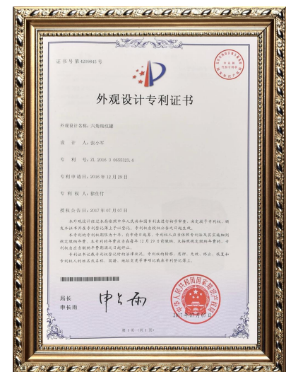
Patent no. : 201630655323.4