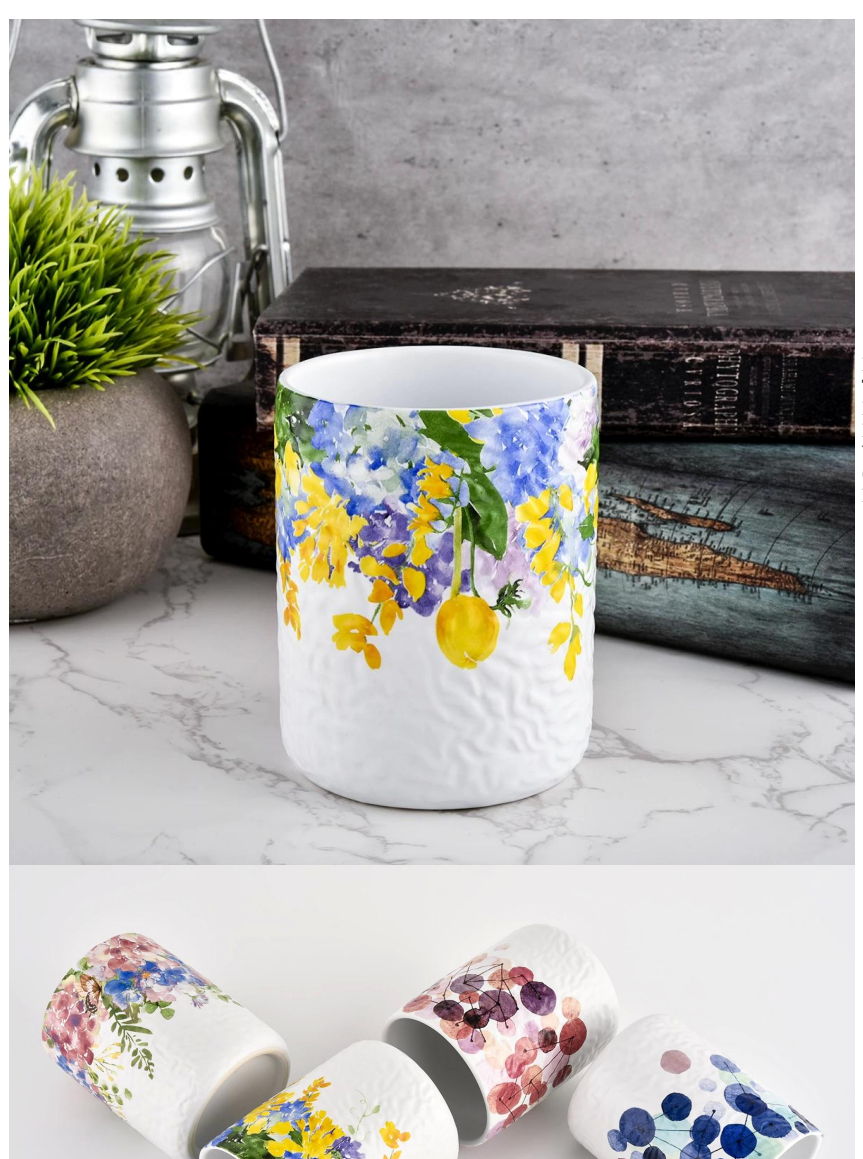
Flexible size design allows your market to grow rapidly

Item name[SGMK21102739 Top dia: 83mm Bottom dia: 83mm Height: 104.5mm Weight: 350g Capacity: 390ml MOQ:3,000PCS