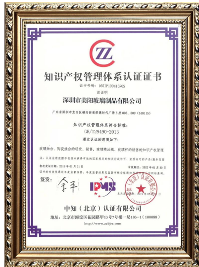
Enterprise Intellectual Property Patent No.:201630655323.4