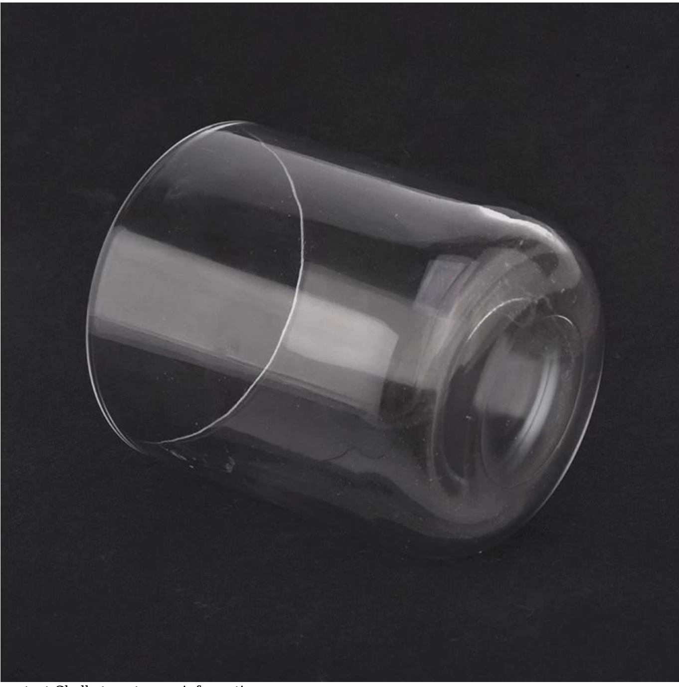
contact Chally to get more information