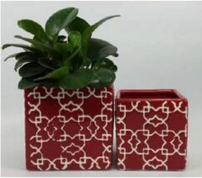
Red S16030-127 12.5×12.5×12.0cm S16030-102 10.0×10.0×10.0cm