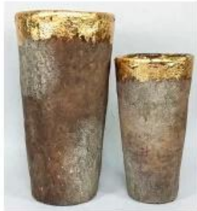
CS10024A-1 14x14x26cm CS10024B-1 11x11x20cm