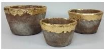
CS10026A-2 20x20x12.5cm CS10026B-2 17x17x10cm CS10026C-2 14x14x9cm