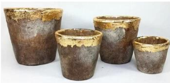
CS10025A-4 20.5x20.5x19.5cm CS10025B-4 17.5x17.5x16.5cm CS10025C-4 14.5x14.5x14cm CS10025D-4 11.5x11.5x10.5cm CS10025E-4 8x8x7cm