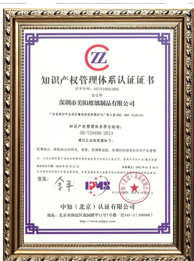
Corporate intellectual property