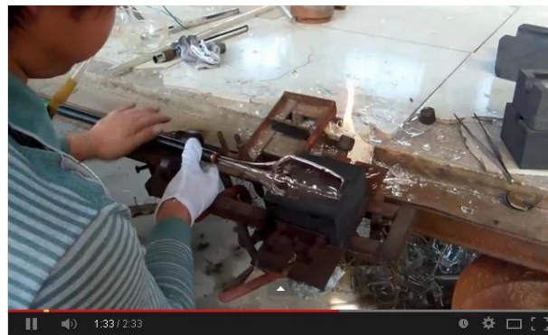
IS machine technology