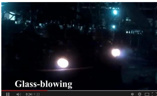
Machine blowing technology

Hereby watch our production line video online, welcome to visit us on site.