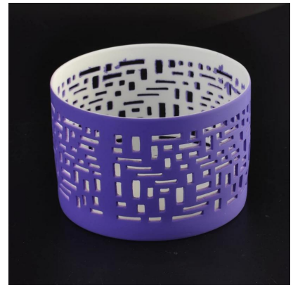
Colored votive candle holder