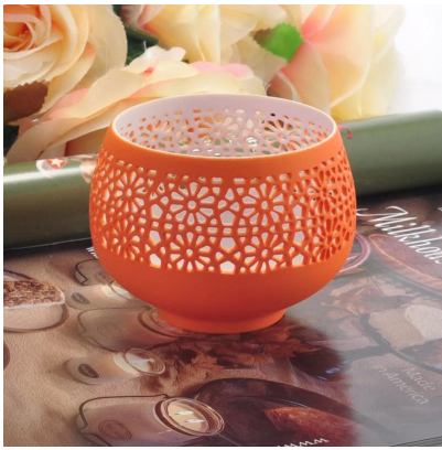
Ceramic candle holders wholesale