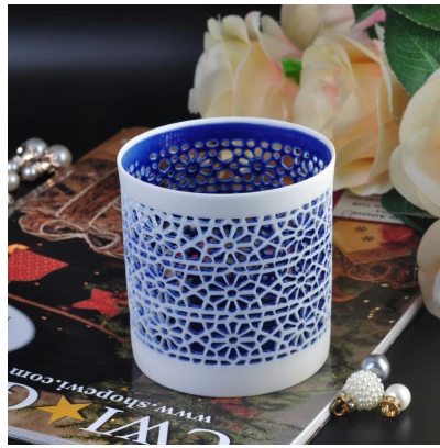
Hollowed-out ceramic tealight holder