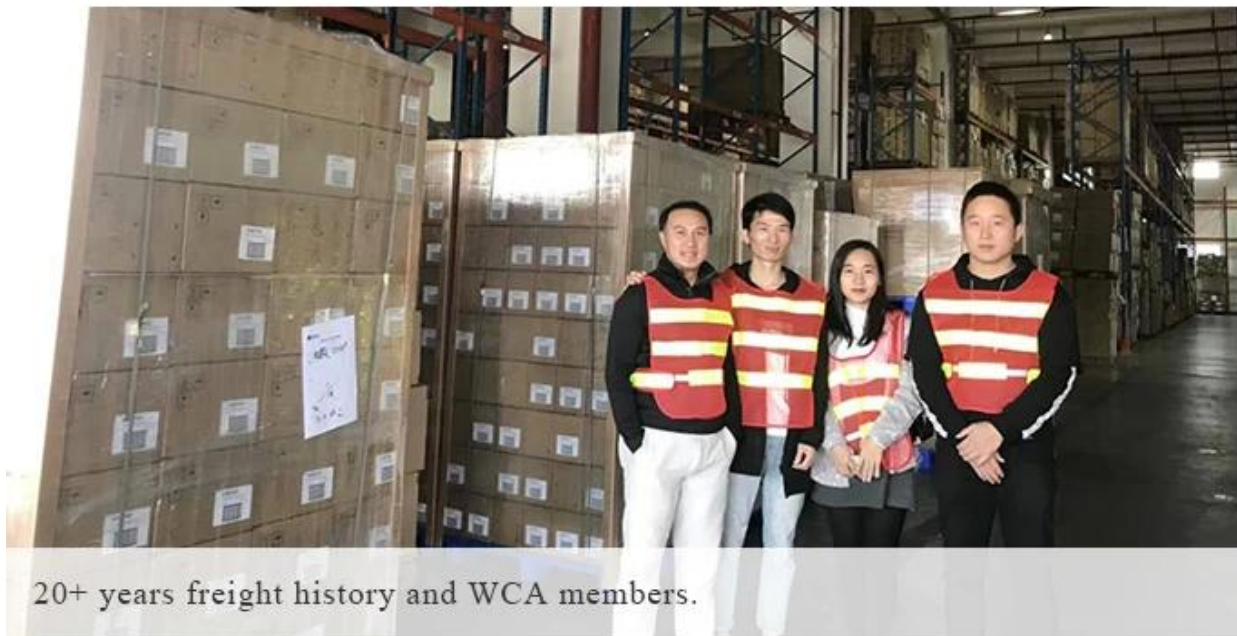
20+ years freight history and WCA members.