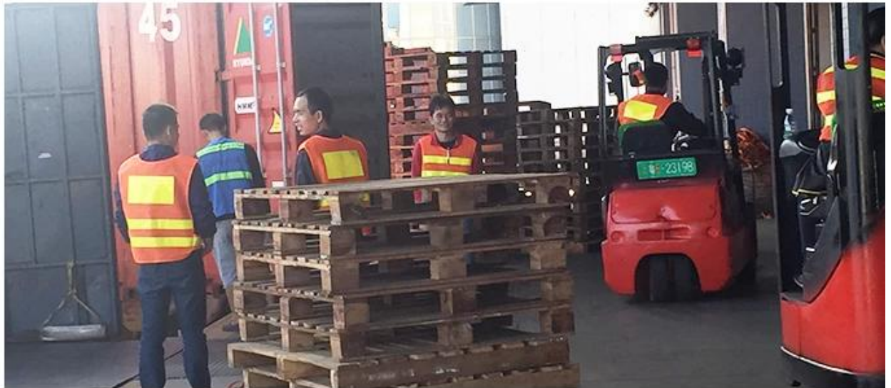
Own professional shipping company( Shenzhen Sunny Worldwide logistics)