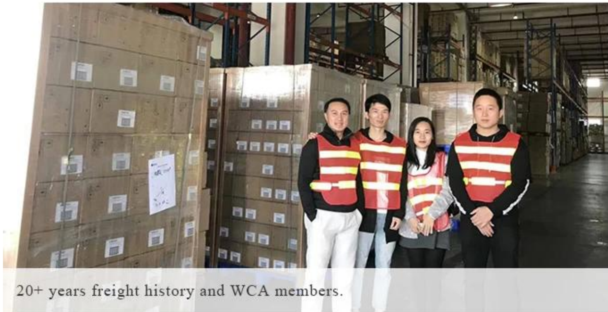
20+ years freight history and WCA members.