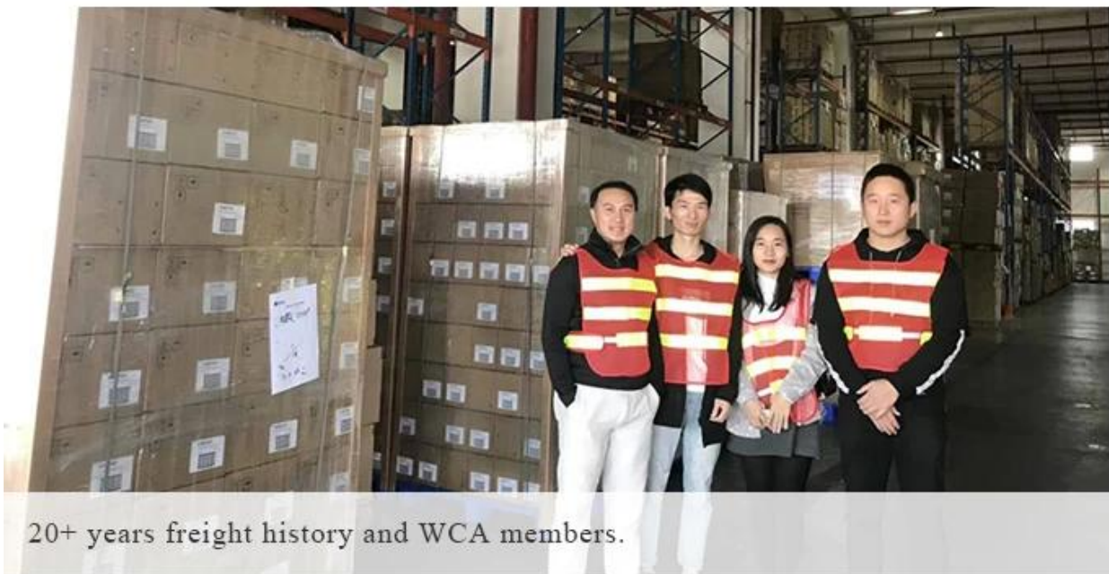
20+ years freight history and WCA members.