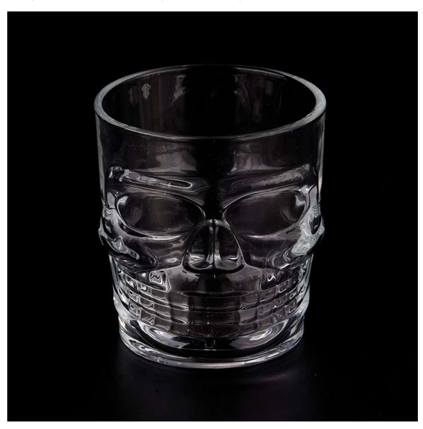
why choose sunshine?

Sunny Glassware not only produces OEM / ODM orders, but also helps many brands start from the product concept.