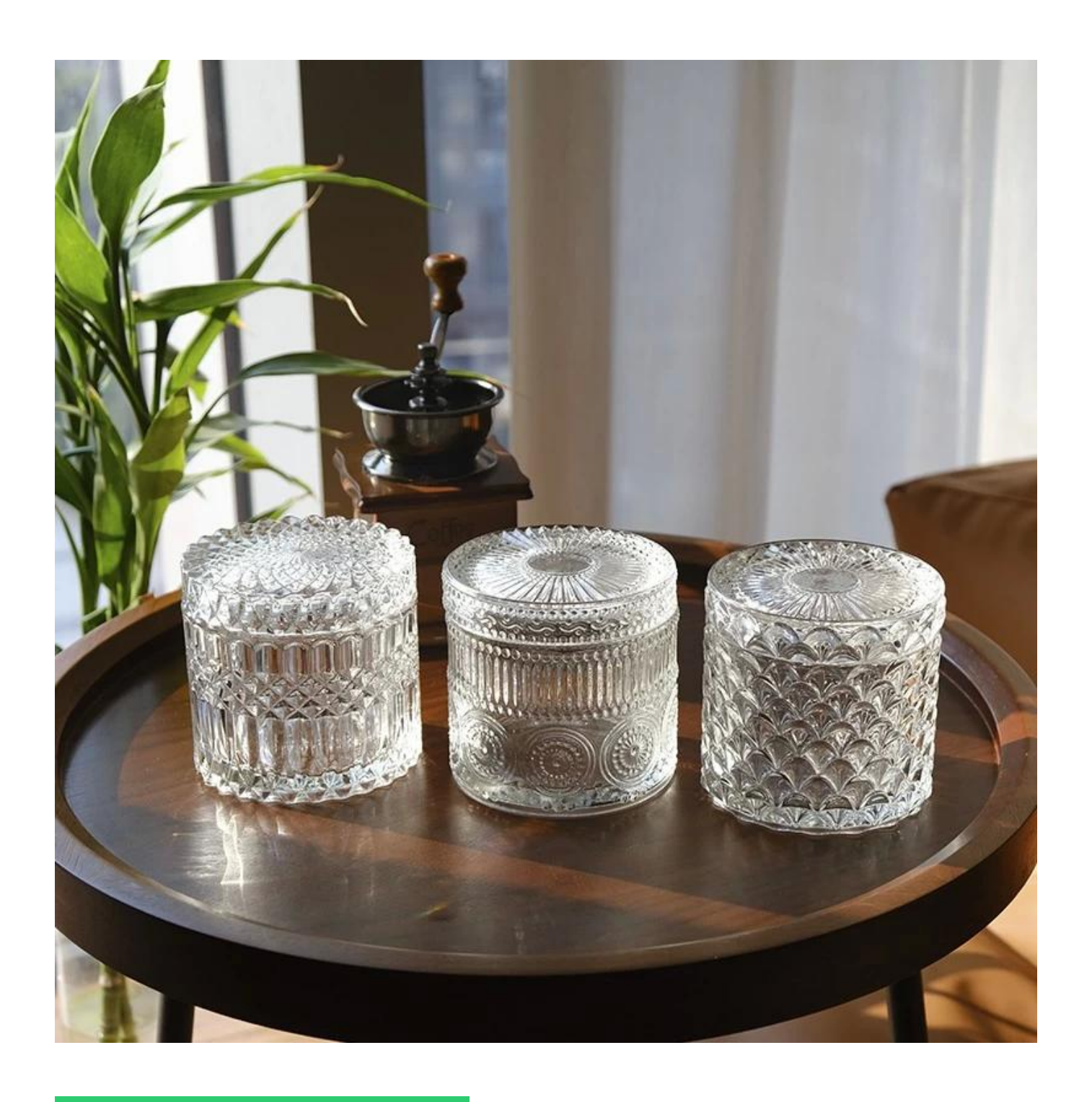
Wide range of application