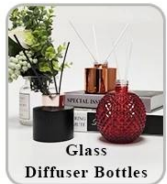
Glass Diffuser Bottles