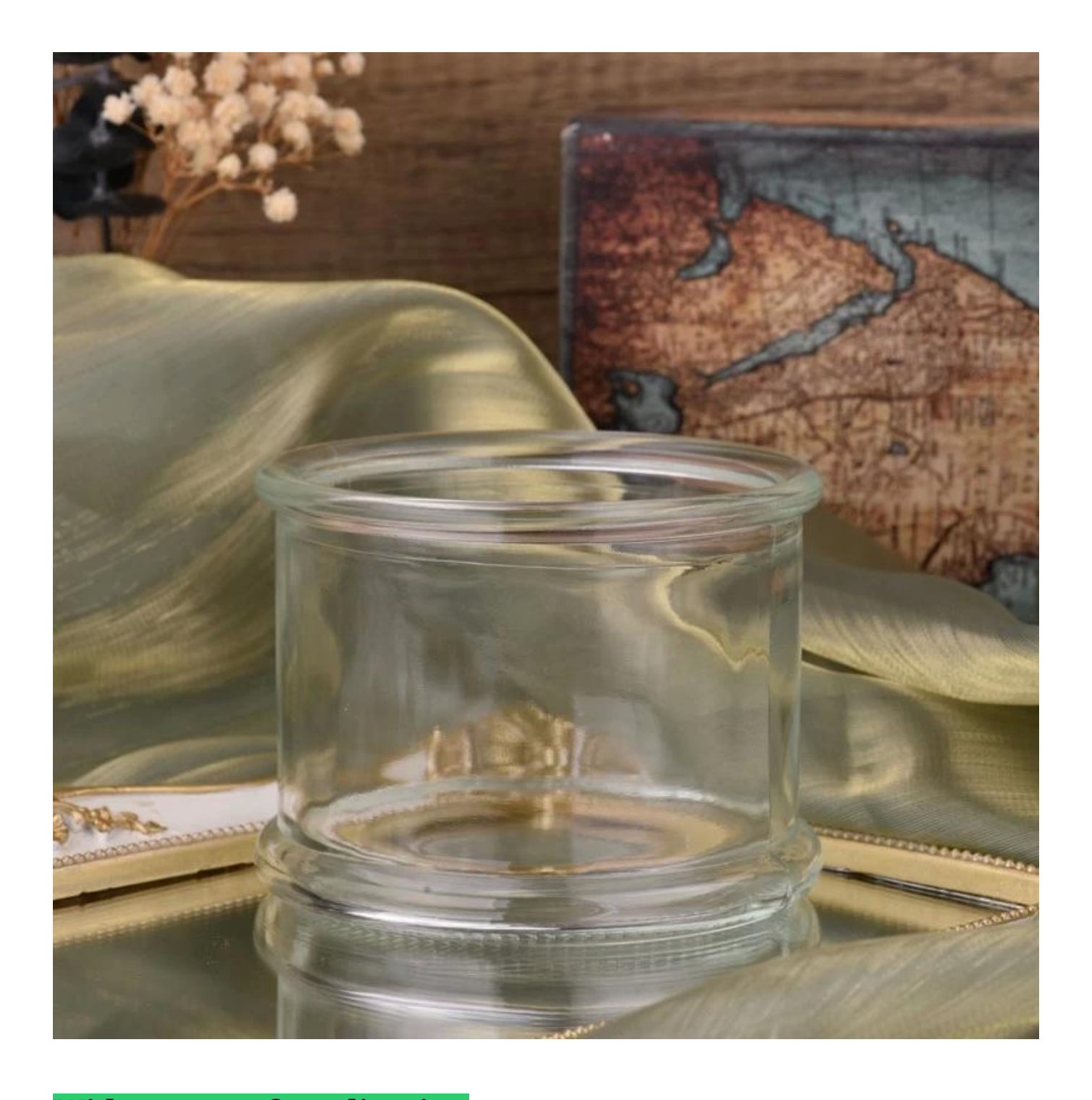
Wide range of application