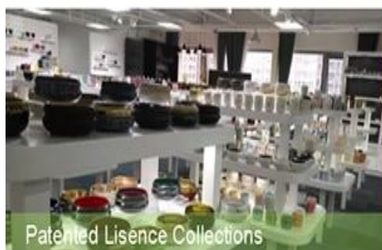
Patented Lisenice Collections