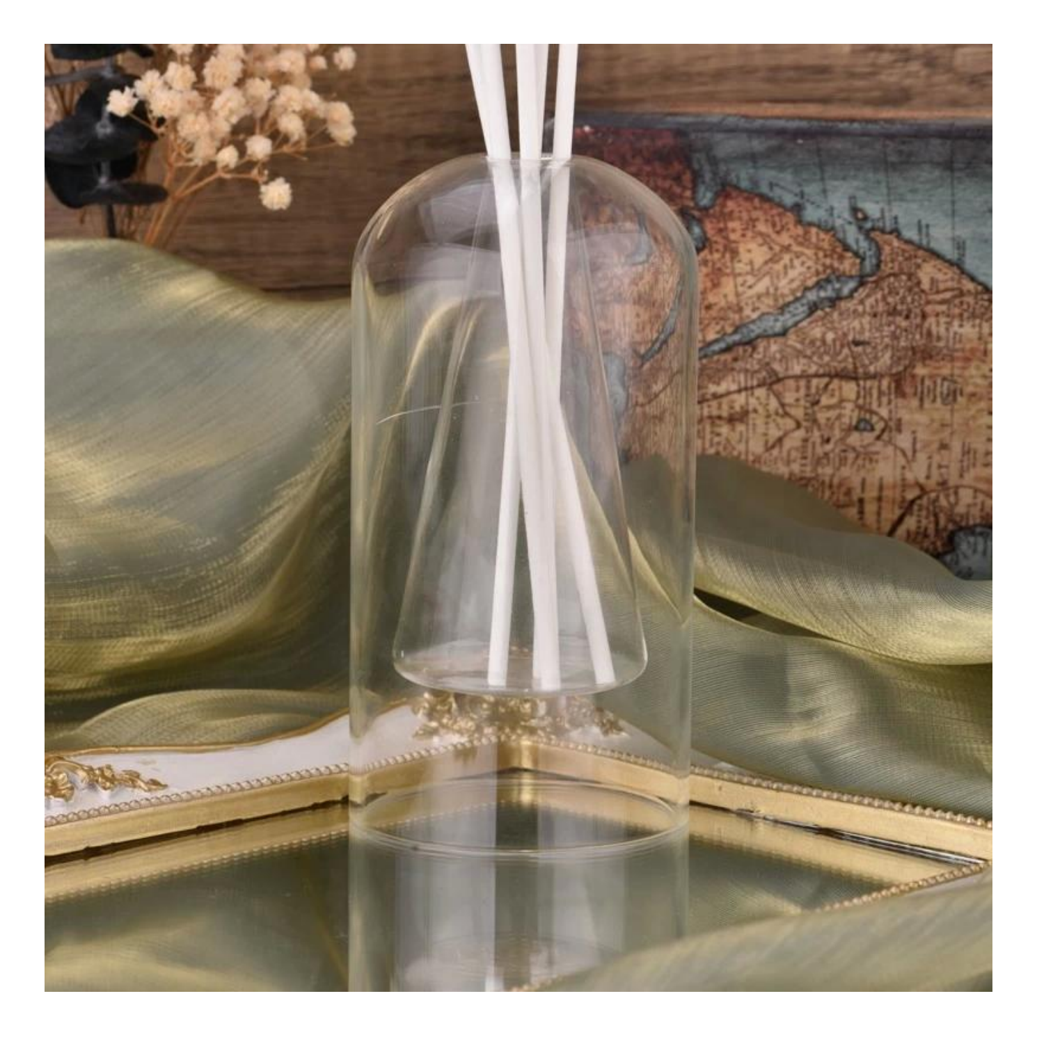
Wide range of application