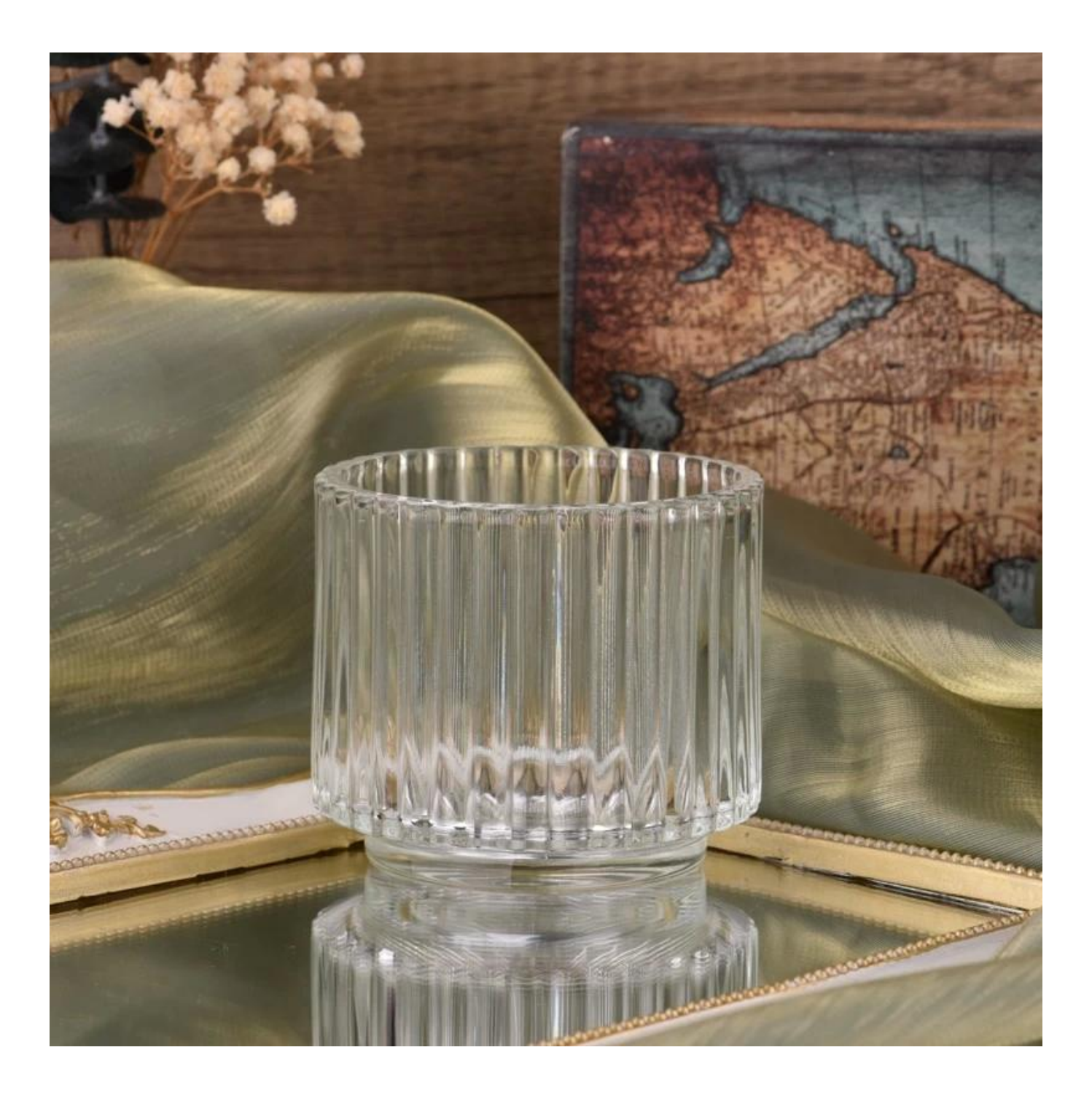
Wide range of application