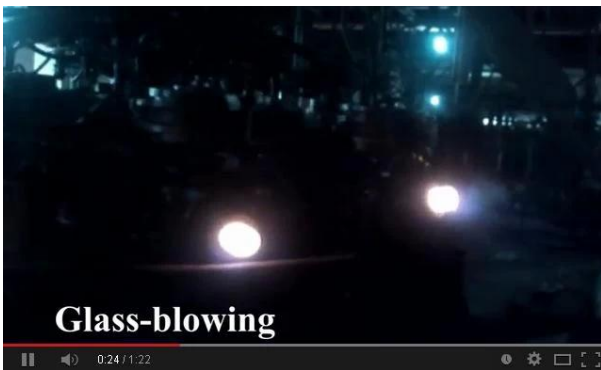
Machine Blown Technology

Hereby watch our production lines video online, and welcome to visit us onsite.