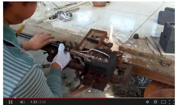
Hand Blown Technology