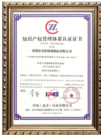
Enterprise Intellectual Property Patent No.:201630655323.4