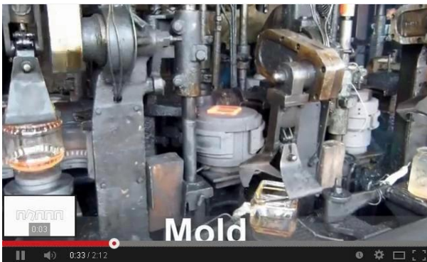
IS Machine Technology