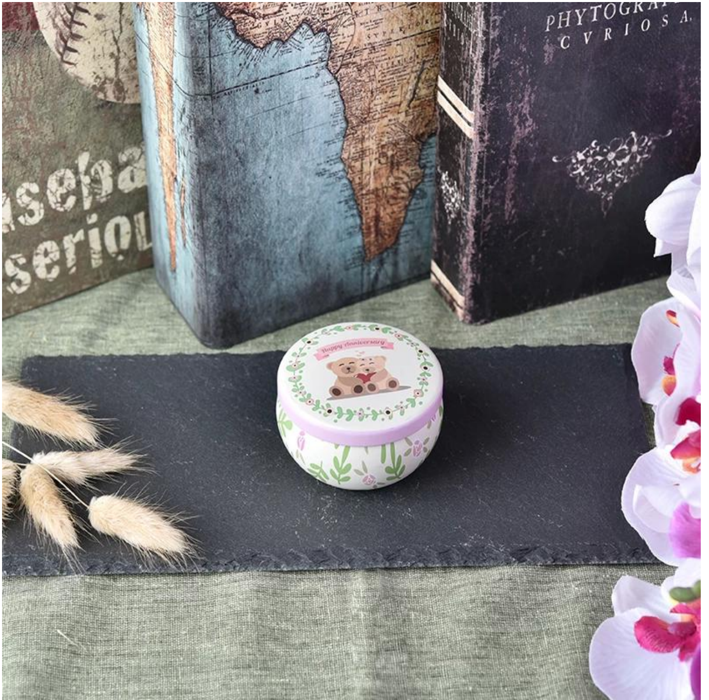
Office & Sample Room