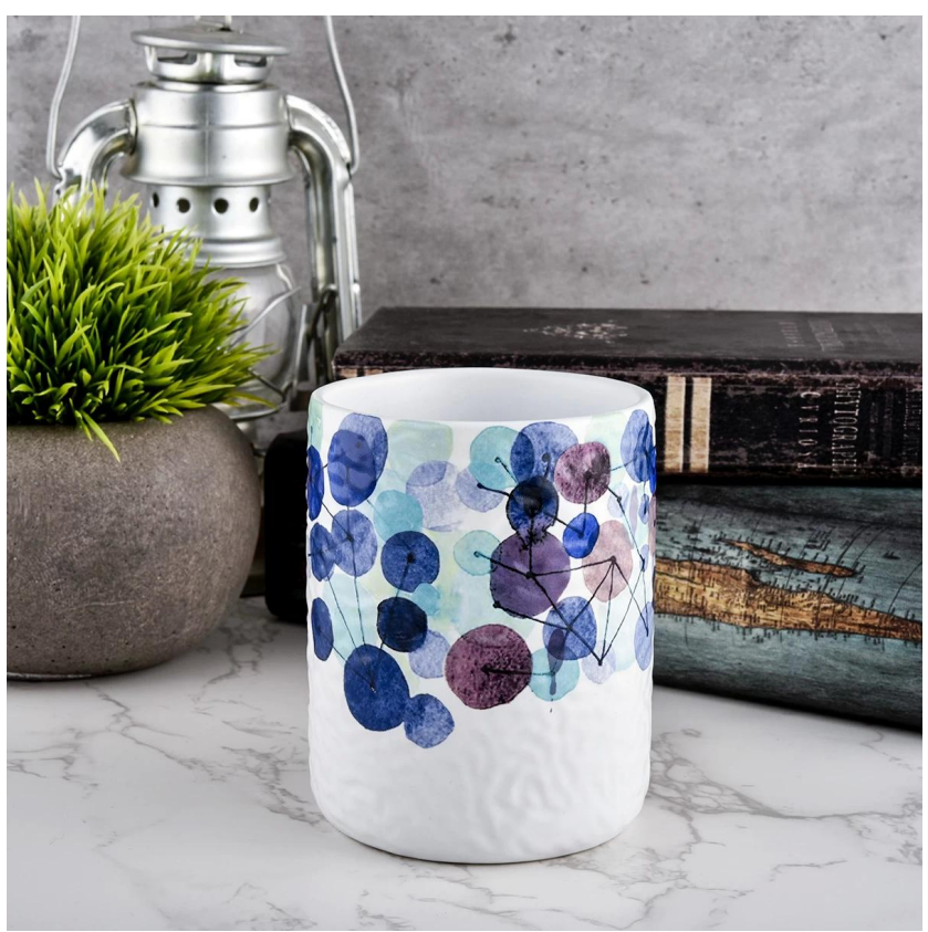
Unique market advantage