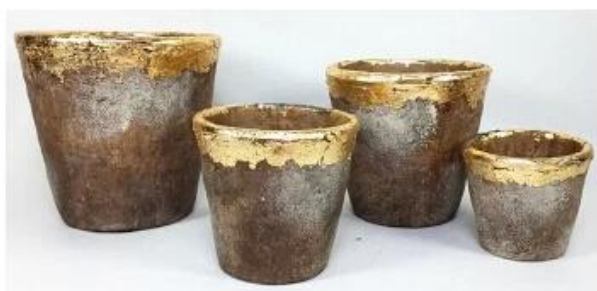
CS10025A-4 20.5x20.5x19.5cm CS10025B-4 17.5x17.5x16.5cm CS10025C-4 14.5x14.5x14cm CS10025D-4 11.5x11.5x10.5cm CS10025E-4 8x8x7cm