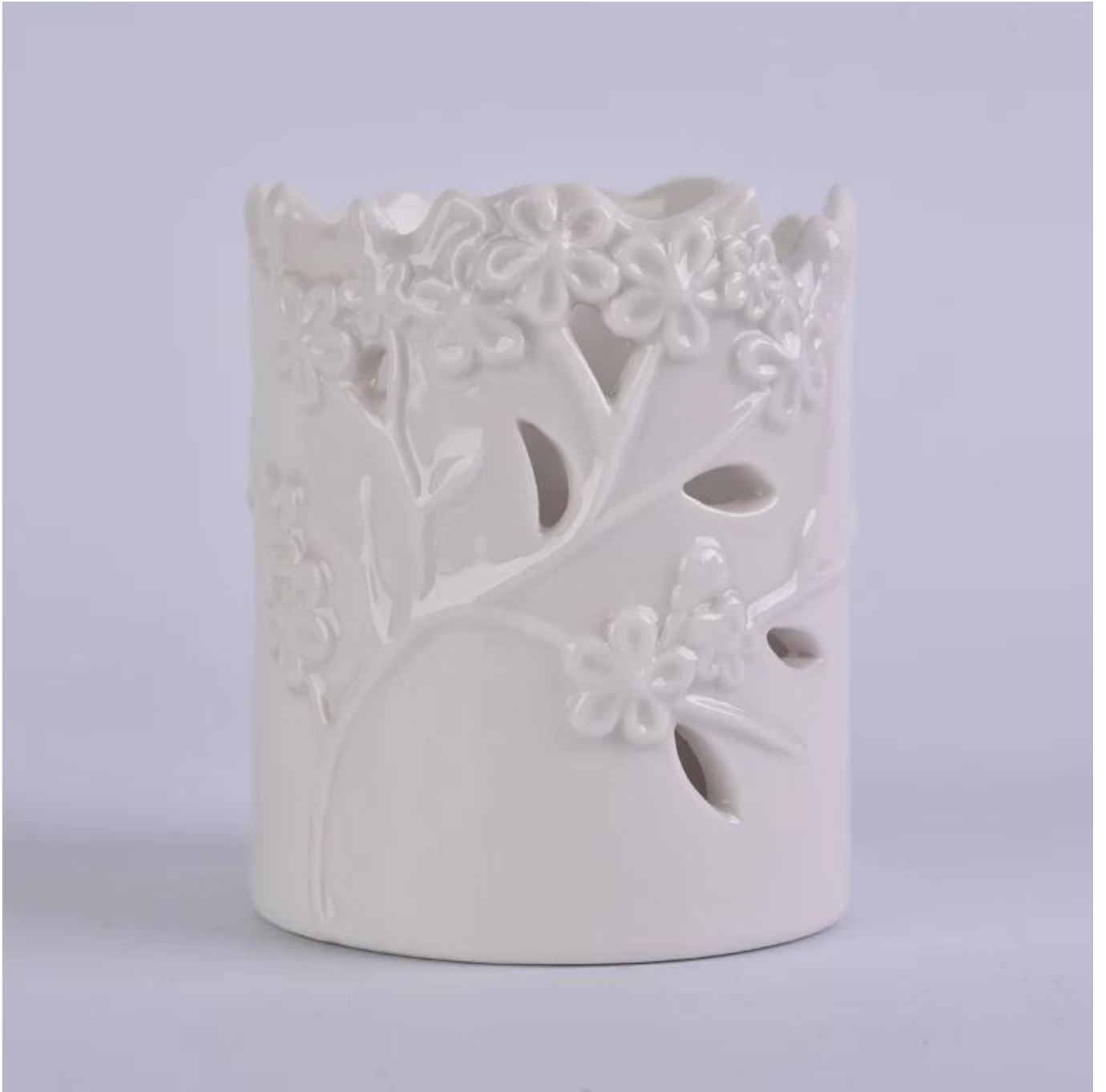
Other Ceramic Candle Holder