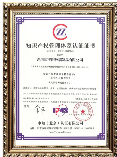
Enterprise Intellectual Property Patent No.:201630655323.4