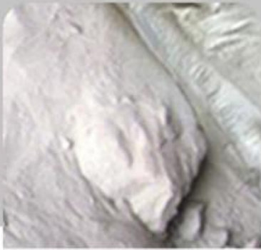
1、 Raw Material