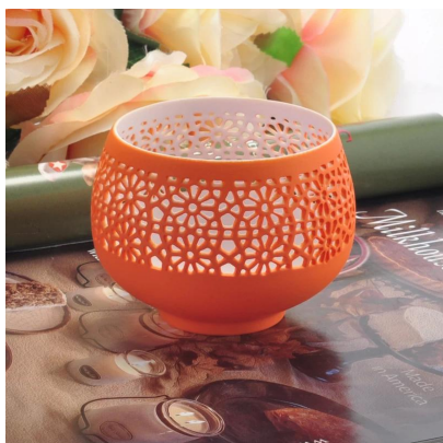
Ceramic candle holders wholesale