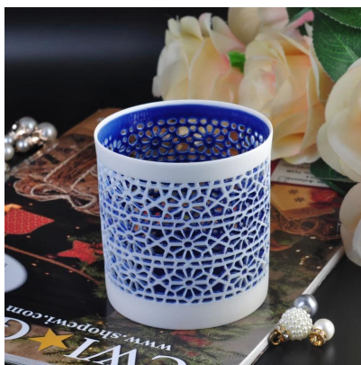
Hollowed-out ceramic tealight holder