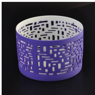
Colored votive candle holder