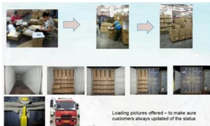
Packing & Loading

Loading pictures offered – to make aure customers always updated of the status