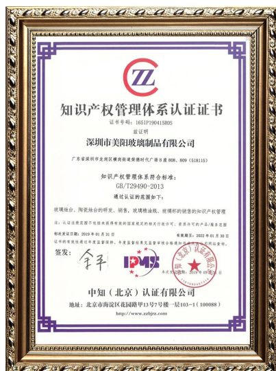
Enterprise Intellectual Property Patent No.:201630655323.4