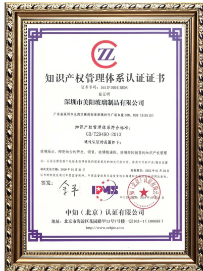
Enterprise Intellectual Property Patent No.:201630655323.4