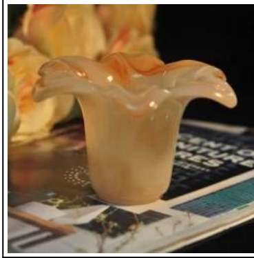
Flower shape cylinder jade amber color decorative glass candle jar candle holder