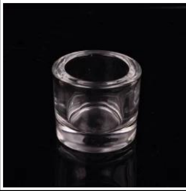
Cylinder tealight candle holder