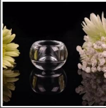
Round small tealight holder