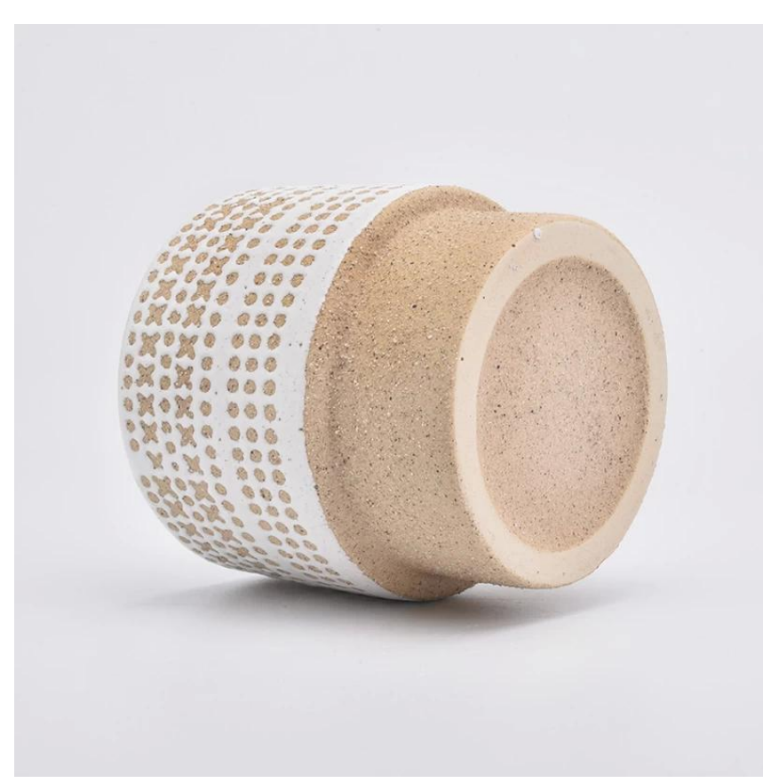
Flexible size design allows your market to grow rapidly