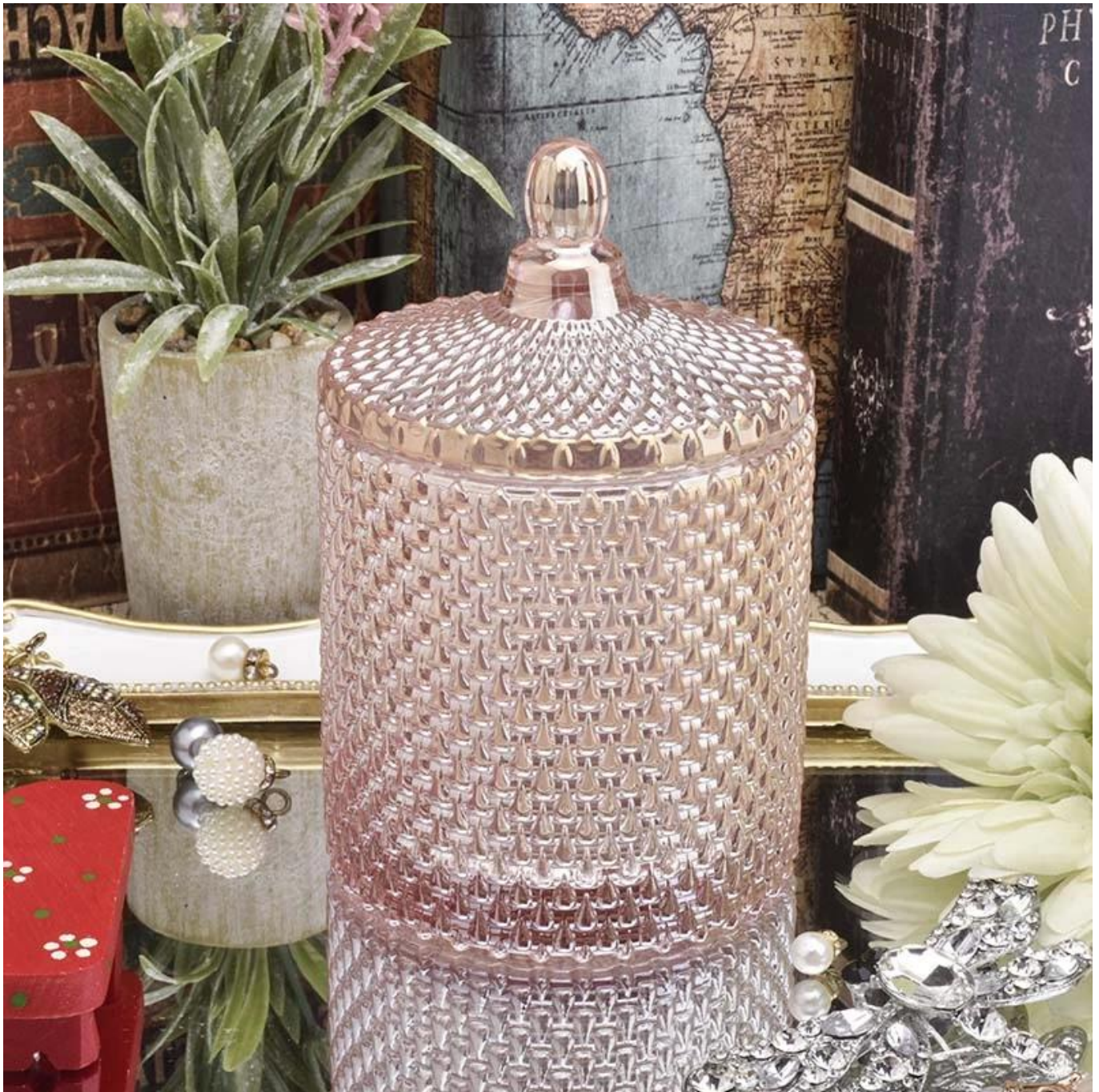
Range of the application