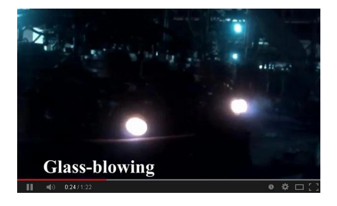
Machine blowing technology

Hereby watch our production line video online, welcome to visit us on site.