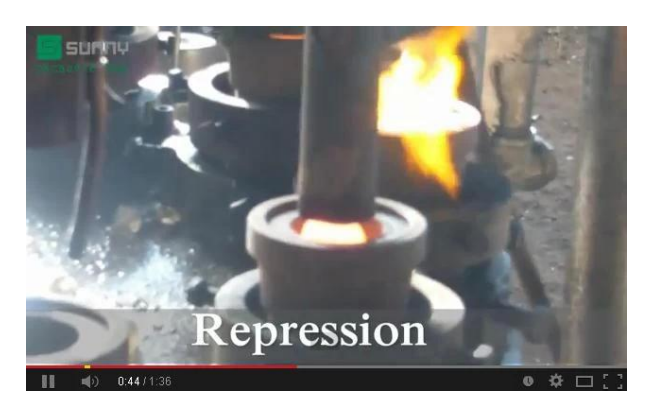
Mechanical press technology