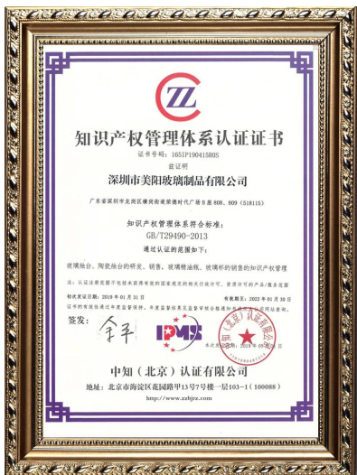
Corporate intellectual property