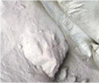
1、 Raw Material