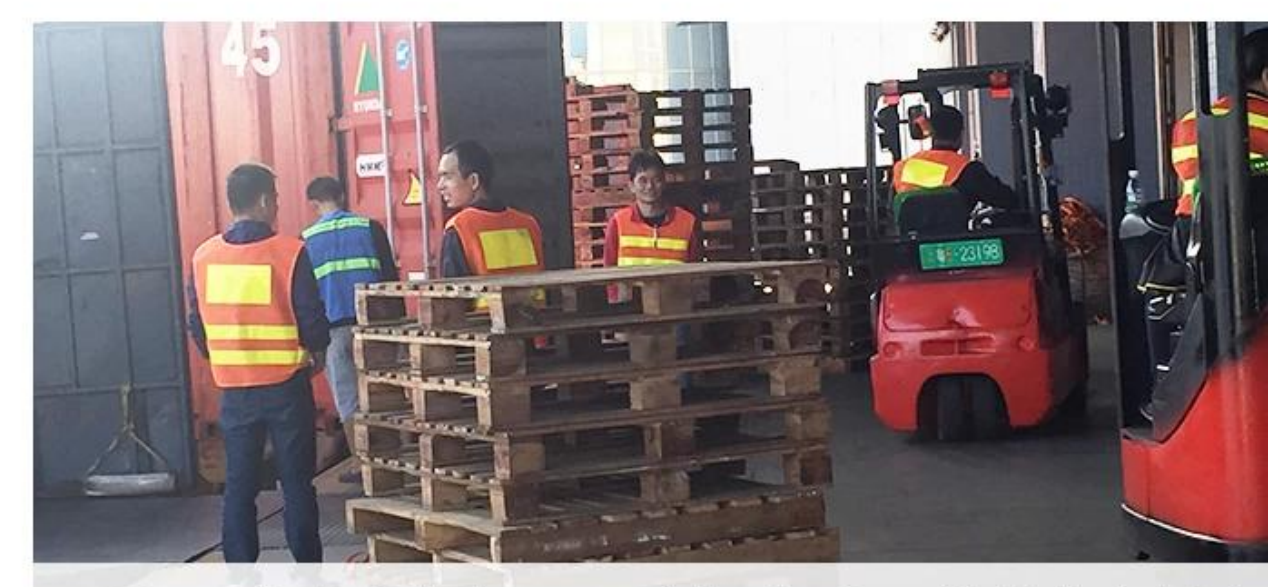
Own professional shipping company( Shenzhen Sunny Worldwide logistics)