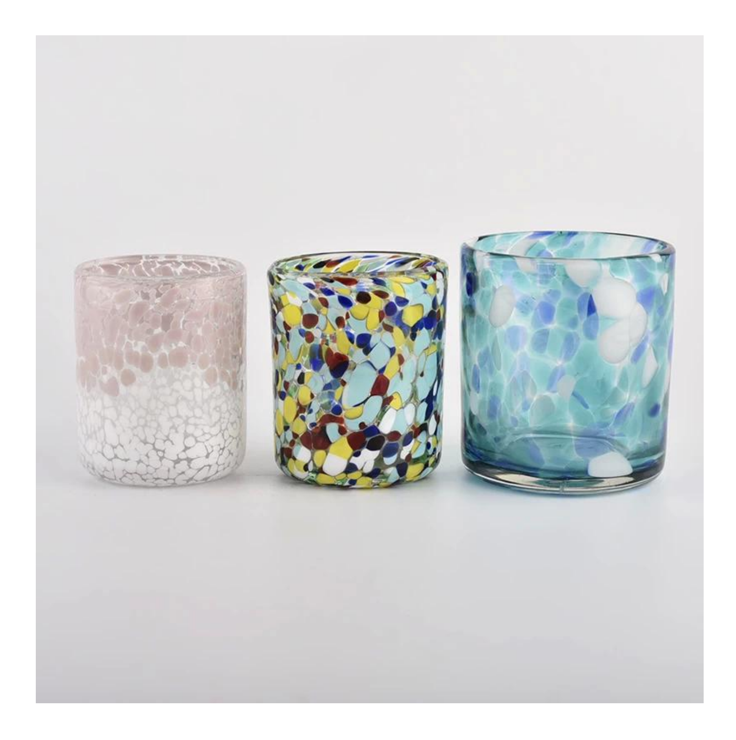
Wide range of application