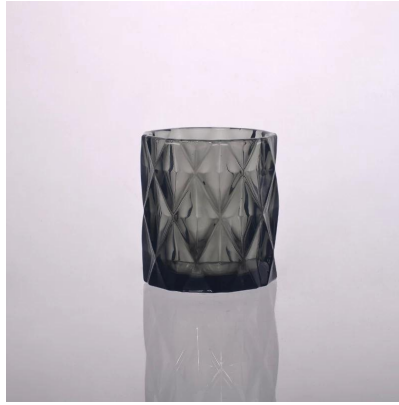
solid color diamond glass candle holders