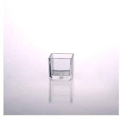
home decor glass square candle holder