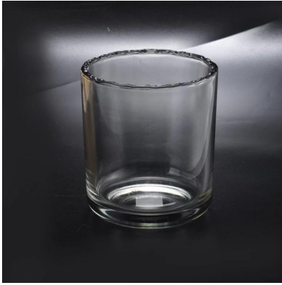
unique home decor lace lace holders