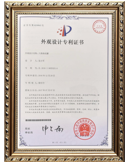
Număr brevet: 201630655323.4