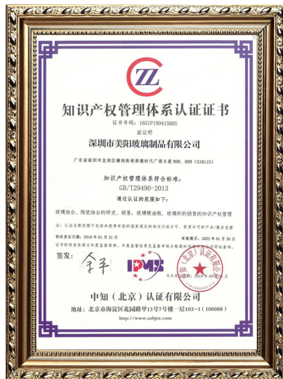
Proprietatea intelectuală a întreprinderii