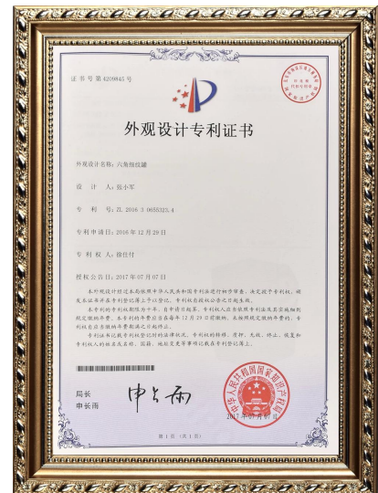
Brevet nr.: 201630655323.4