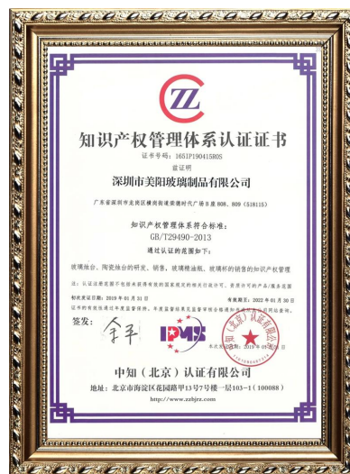
Corporate intellectual property