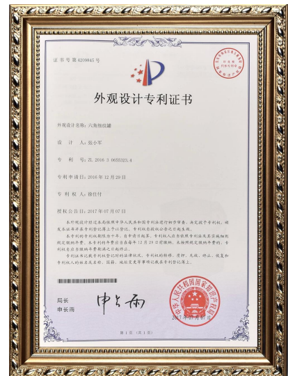
Patent nr: 201630655323.4