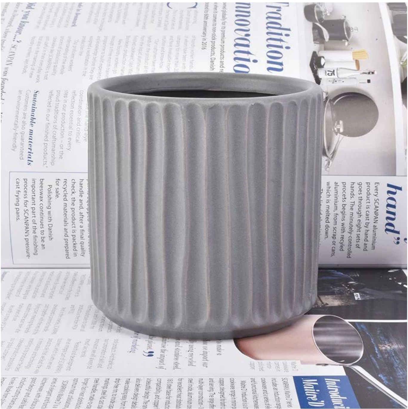
Office & Sample Room