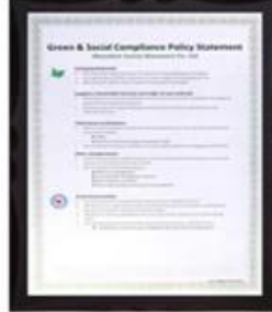
Green & Social Compliance