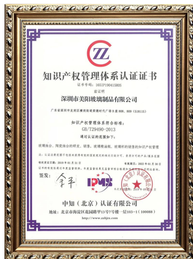
Şirketin fikri mülkiyeti