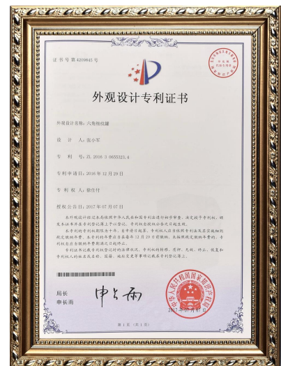
Patent numarası: 201630655323.4