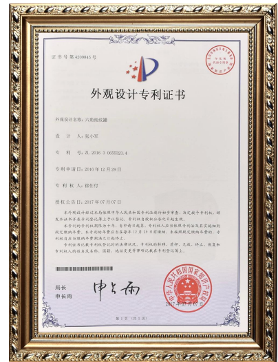
Ilungelo elilodwa lomenzi wechiza: 201630655323.4