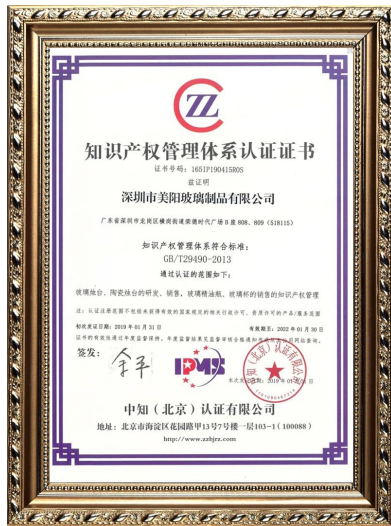
Umzi mveliso wepropathi enomgangatho ophezulu wokuqonda