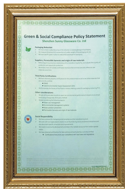
Ukuthobela okuluhlaza kunye neNtlobo Ingxelo yePolisi