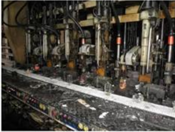
☐ IS Machine