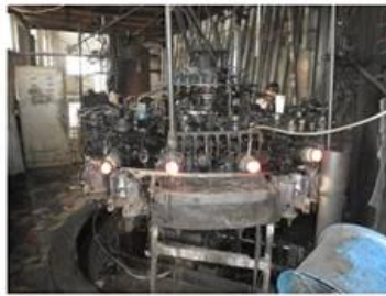
☐ Machine Blown