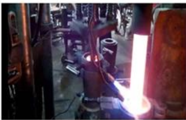
☐ Machine Pressed